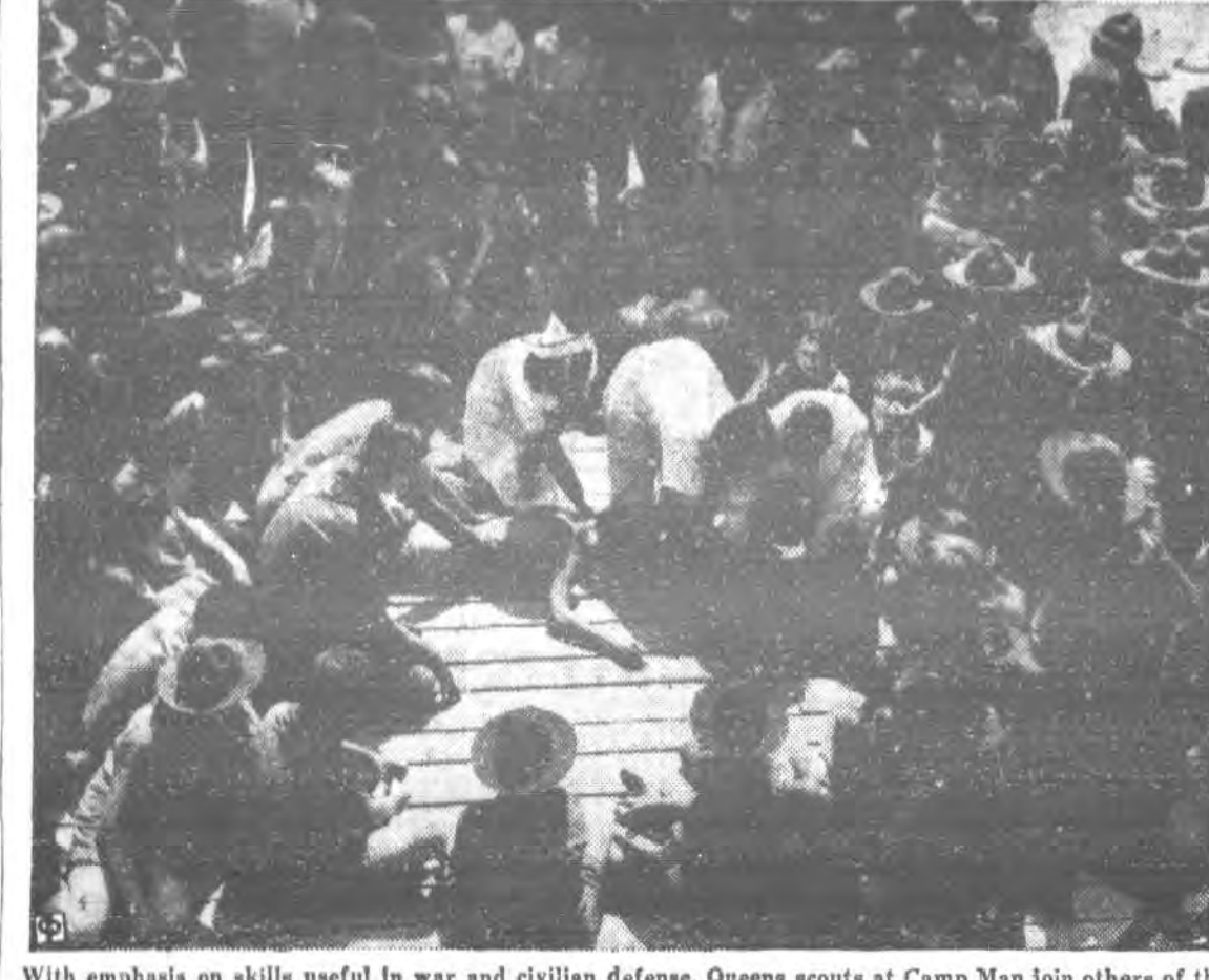
With emphasis on skills useful in war and civilian defense, Queens scouts at Camp Man join others of the chain of scout camps along Ten Mile River in Sullivan County to watch a demonstration of the use of the inhalator. The training in emergency skills supplements the regular camping activities.